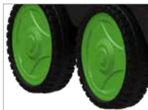
LARGE DIAMETER WHEELS IN ORDER TO FACILITATE MOVEMENTS