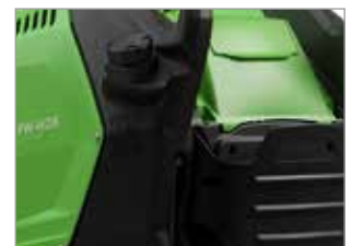
STURDY AND LARGE TANK IN ROTOMOULDED PLASTIC MATERIAL