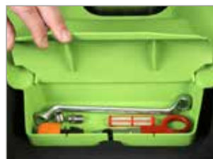
ACCESSORY STORAGE COMPARTMENT